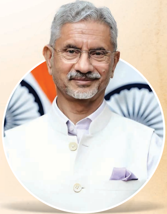
CHIEF GUEST Dr. Subrahmanyam Jaishankar Honourable Minister of External Affairs of India & Member of Parliament, Rajya Sabha