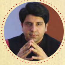
Mr. Shehzad Poonawalla National Spokesperson, Bharatiya Janata Party